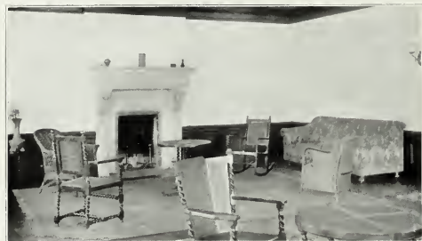
BISHOP HALL PARLOR